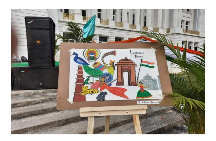
Paintings by Students